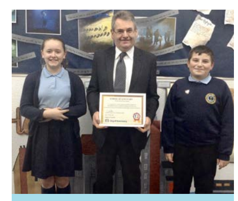
Receiving our School of Sanctuary Award