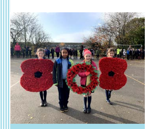
Lest We Forget