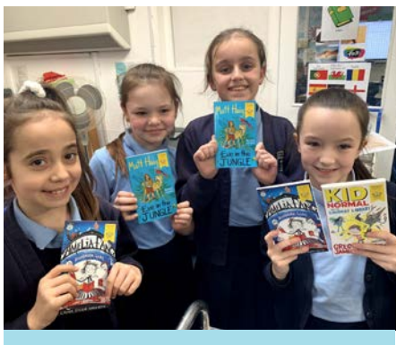
World Book Day- free books to take home