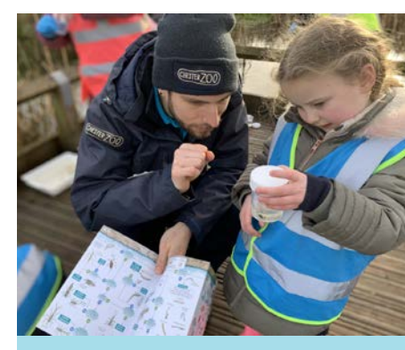
Family Wildlife Club