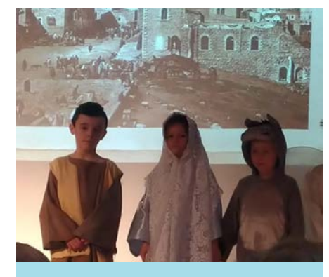
A brilliant KS1 Nativity